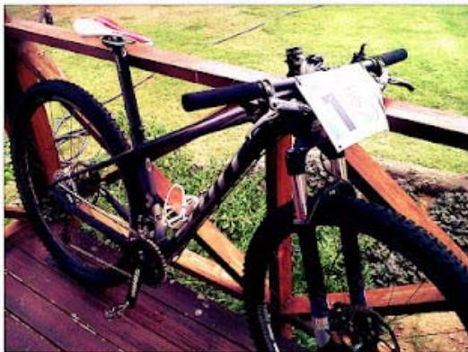
My Scott Scale 29er