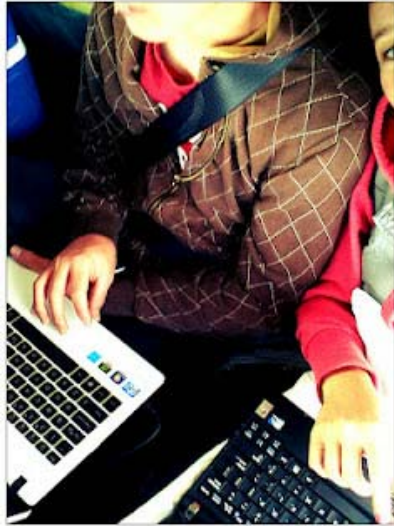
Blogging away, and movie time!