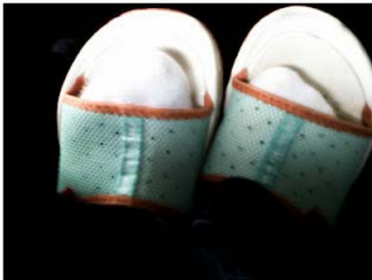
My Salomon Recovery Slops

My last lap towards the finish to my first ever National Win :)